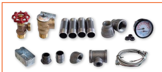
Included Parts Kit